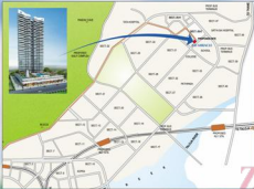
Site: Plot No. 28, 27, 29, Sector - 19C, Kharghar, New Mumbai