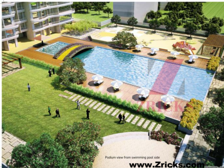
Podium view from swimming pool side